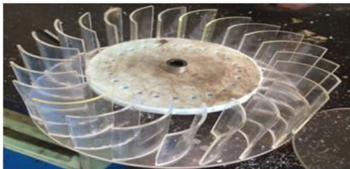
Figure 1. Runner Cross Flow Turbine