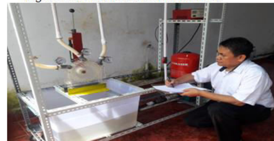
Figure 5. Research Activities