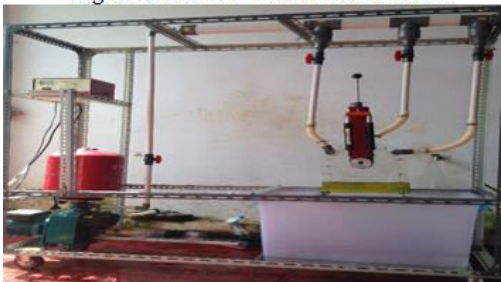
Figure 4. Instalasi Experiment