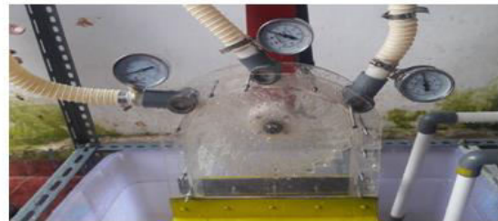
Figure 2. Multi Nozzle and Manometer

Materials and tools of research are cable, rivet, pulley, belt, shaft, welding electrode, sandpaper, paint, frame, iron, saw, welding machine, drill machine, meter, Stop Watch, Torsimeter, Flowmeter, Multimeter, Dial gauge, Manometer, Thermometer, Micrometer, Electrical regulator, Voltmeter, Amperemeter, Thermometer, Measure Glass. The procedure of the implementation of this research activity is the preparation of materials and Instruments, installation. Calibration, measuring cross flow turbine performance variables, analyzing, evaluating turbine performance scheme installation of turbine cross flow research multi nozzle.