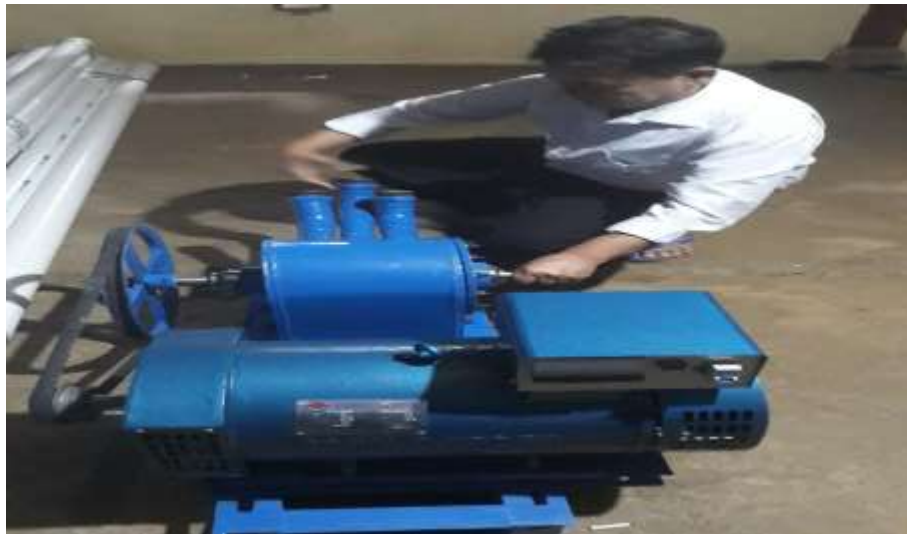
Figure 6 Multi Nozzle Cross Flow Turbine

Multi-nozzle cross flow turbine is assembled from iron plate material which is processed by using several production machines in accordance with the dimensions of the design and in full can be seen in figure 6 as follows :