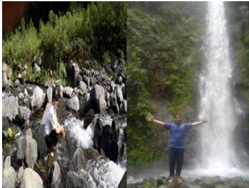
Figure 1 Remote Regional Energy Sources

Since the advent of cross flow water turbines, much progress has been made through research through laboratory experimental methods especially on turbine design parameters such as angle of arrival, number of blades, runner diameter ratio, runner width, and nozzle dimensions [5]. Some researchers also conduct laboratory studies on cross flow turbines that aim to show a series of results of cross flow turbine tests made based on different specifications to improve optimal turbine performance. Water turbine is a turbine that uses water as its working fluid and a very simple power generation consisting of water sources, water reservoirs, water turbines and generators. The turbine functions to change the potential energy as shown in Figure 1 and the kinetic water into mechanical power [6].