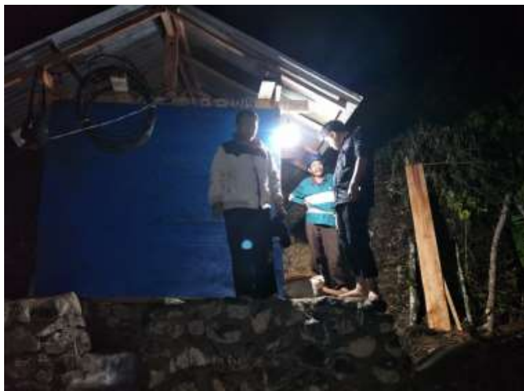
Figure 7 Installation of the Produced Electric Plant

In figure 7 above, it can be seen that the powerhouse has produced electric light in a functioning river basin. From the results of calculations and data analysis it can be explained that the mechanical energy of the cross-flow water turbine that has been applied as the main driver of a micro-hydro power plant is capable of producing high capacity power [27]. Then the turbine power also is very dependent on the amount of potential energy of water that can be converted into kinetic energy at the turbine nozzle. The large capacity of water out of the nozzle can have a very high speed to move the turbine blade. After hitting the blade, the flow velocity changes so that the momentum changes which causes the turbine wheel to rotate and generate mechanical power for the water turbine [28].