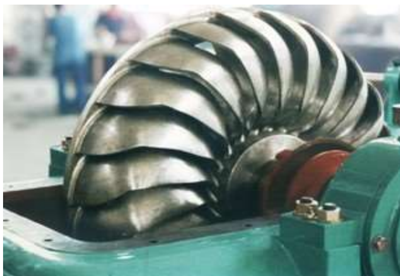
Figure 3 Turgo Turbine

Turgo turbines are impulse type water turbines that are designed for medium heads and can operate on heads from 30 to 300 meters. Turgo turbines have several advantages compared to Francis and Pelton types for certain applications, including making runners more easily compared to Pelton types, does not require turbine houses that are soundproof, have higher specific speeds and can handle greater water flow, efficiency around 80 to 90%. Figure 3 shows the shape of the Turgo turbine runner like a Pelton runner that is split in half [15]. For the same strength, the Turgo runner is half the diameter of the Pelton runner, and twice the speed. The Turgo turbine can handle a larger flow of water than Pelton because water output does not interfere with adjacent blades. The components of the Turgo turbine are shown in the following figure which have major components including the generator, inlet nozzle, and runner