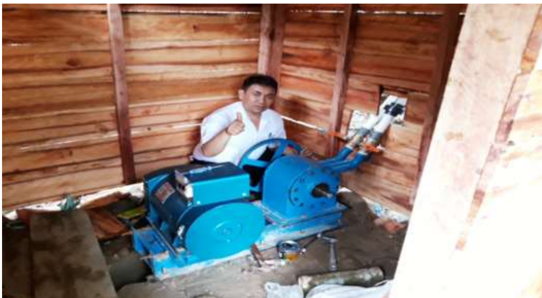
Figure 5 Cross Flow Turbine Multi Nozzle, Generator In Power House