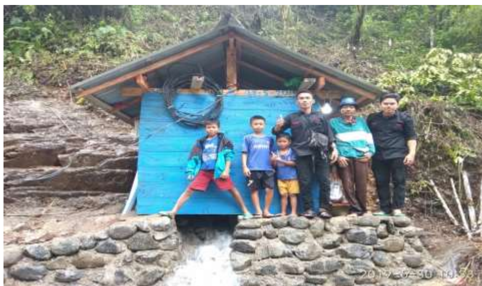
Figure 8. Power House Electric Generators

The advantages of applying water energy power plants are because they are sustainable and clean, energy, do not cause pollution, are easily converted to electrical energy and have a large kinetic energy intensity and do not need a structure that is too strong.